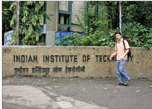
Leading institutions of the country have been found to be short-staffed

The ministry said that despite the large number of vacant faculty positions, there is "no effect on studies in these institutions." While officials at these institutes agree with the fact that faculty shortage does not affect the daily functioning of the institute, they however claim that their rankings